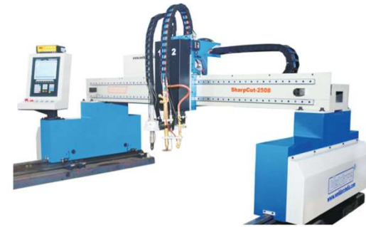
Gantry Type CNC Flame Plasma Cutting Machine