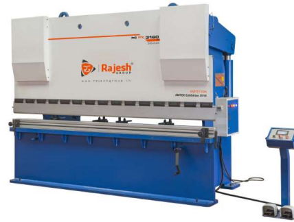
Hydraulic Press Brake Machine 6000 X 8 mm