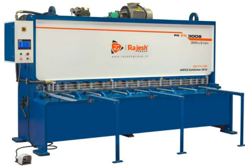
NC Hydraulic Shearing Machine 3000 X 8 mm