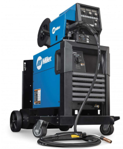
MIG 400 Welding Machine